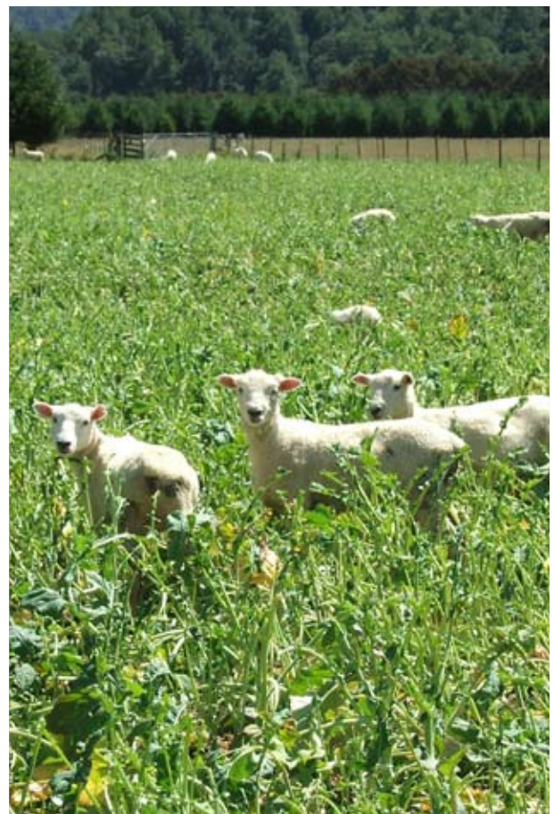
Stock grazing Titan

Results of Spring Sown Rape Trial at Lincoln. (Sown 3 December 2008; harvested 6 April 2009.)